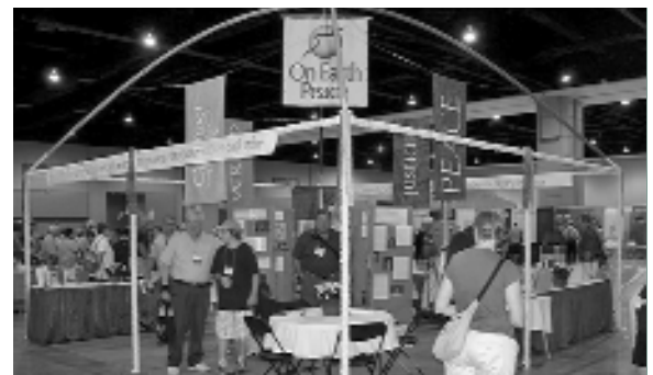
On Earth Peace's 2008 booth was a gathering place for those interested in talking about peace in their communities.

For locations, stop by the On Earth Peace booth.